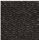
Anthracite mottled 81.02