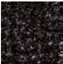
Black mottled 81.01