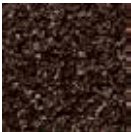
Brown mottled 81.04