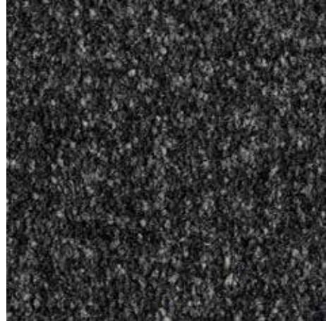
Black mottled 81.01