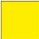
Yellow - similar to RAL 1018