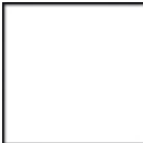
White - similar to RAL 9010