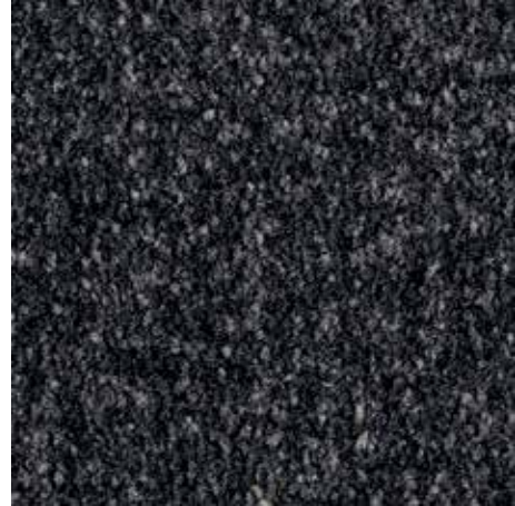
Black mottled 81.01