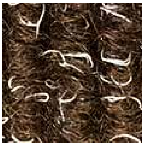
Brown no. 485