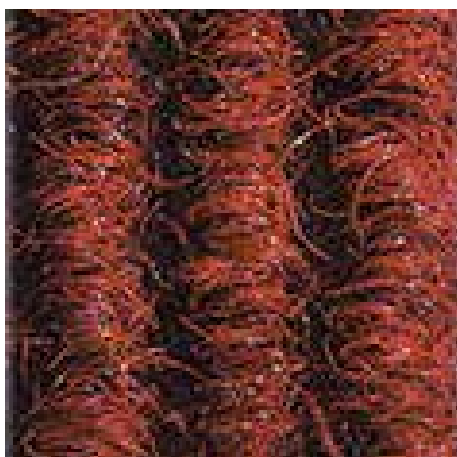
Red no. 305