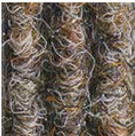
Sand no. 430