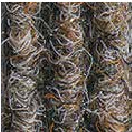
Sand no. 430