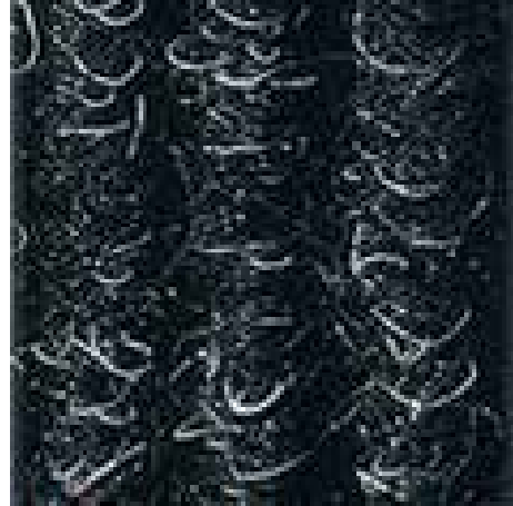
Anthracite no. 200