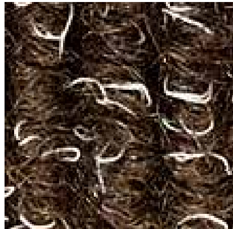
Brown no. 485