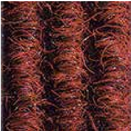
Red no. 305