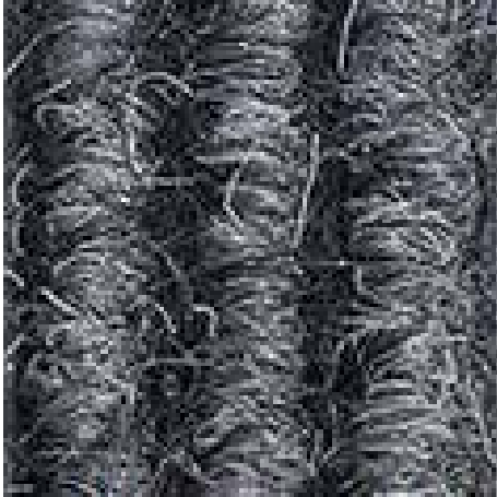
Light grey no. 220