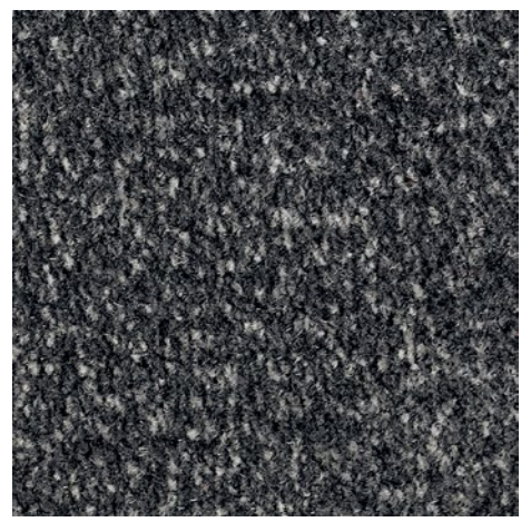
Anthracite mottled 81.02