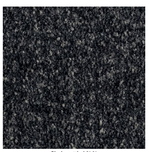
Black mottled 81.01