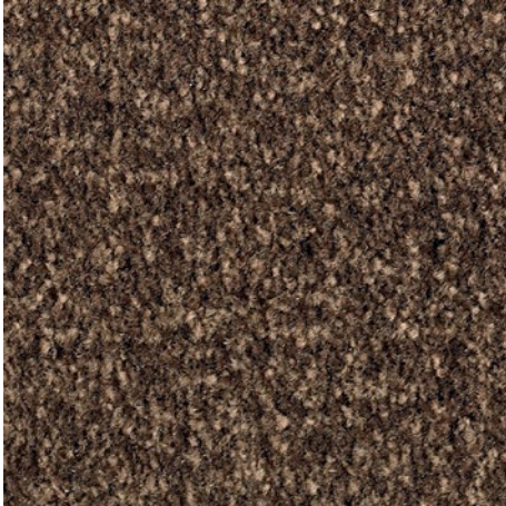
Brown mottled 81.04