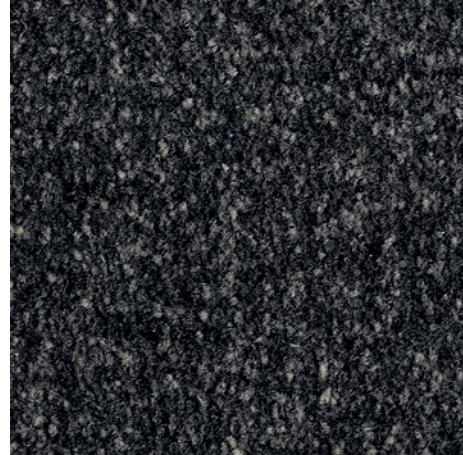
Black mottled 81.01