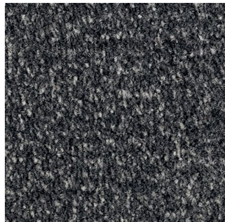
Anthracite mottled 81.02