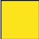
Yellow - similar to RAL 1018