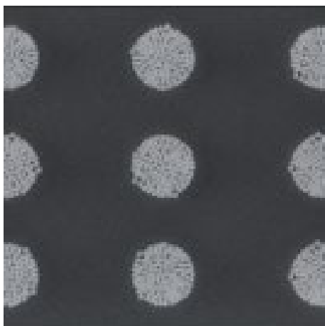
Bristle bundles in grey