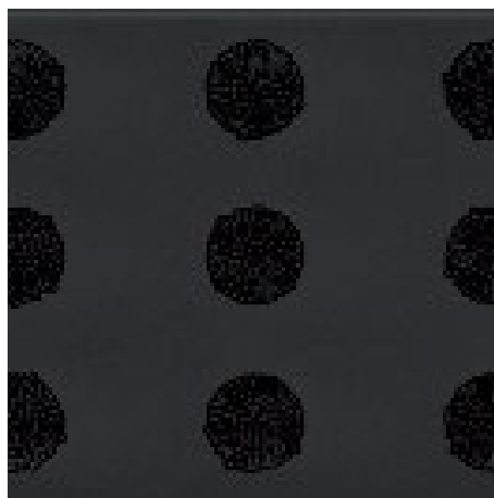
Bristle bundles in black

Warranty conditions are available at: www.emco-bau.com/en/warranty-conditions/