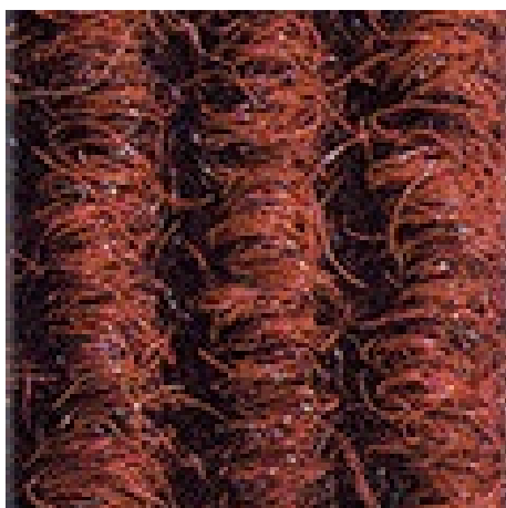
Red no. 305