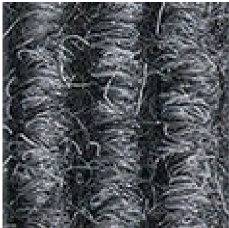
Light grey no. 220