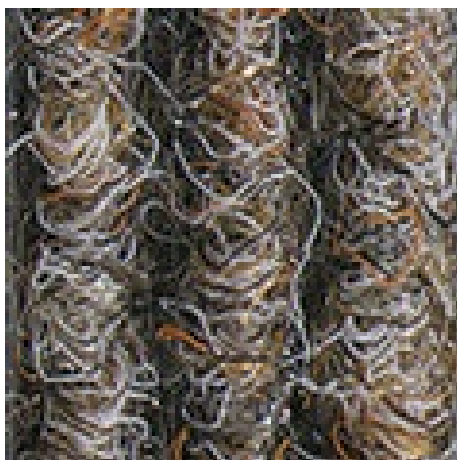
Sand no. 430

Warranty conditions are available at: www.emco-bau.com/en/warranty-conditions/