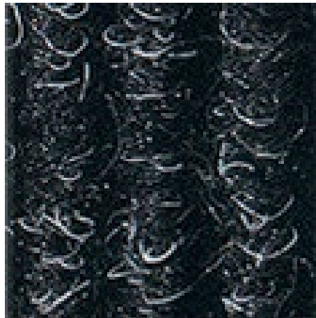
Anthracite no. 200