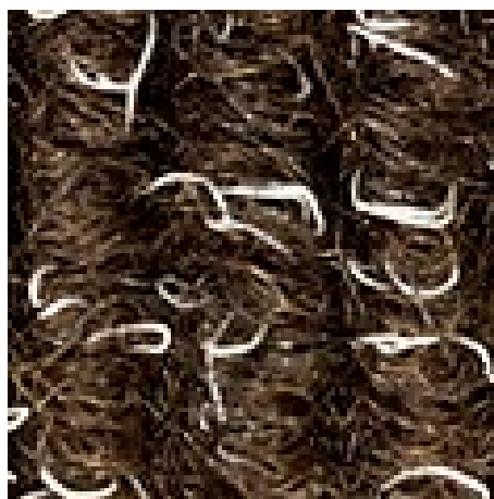
Brown no. 485