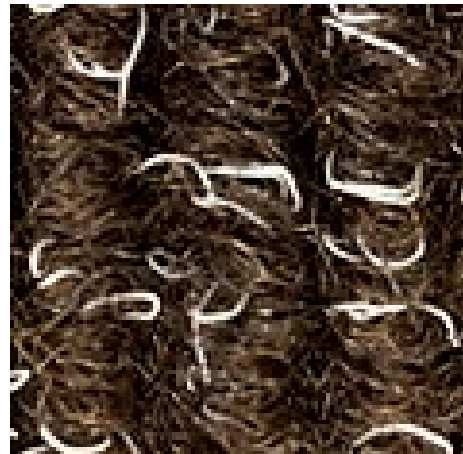
Brown no. 485