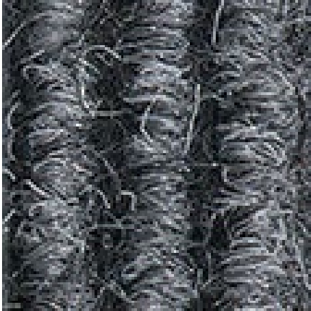
Light grey no. 220