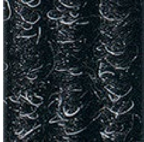
Anthracite no. 200