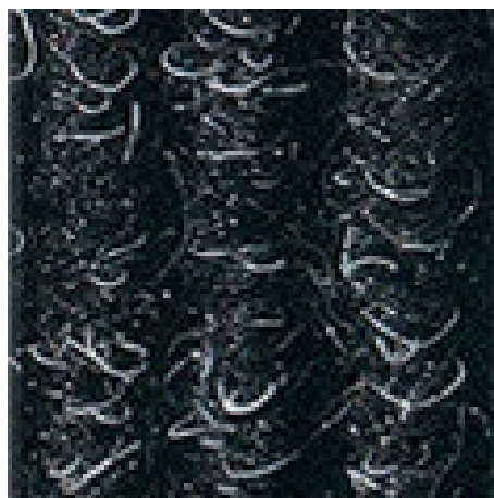
Anthracite no. 200