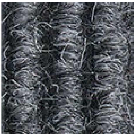
Light grey no. 220