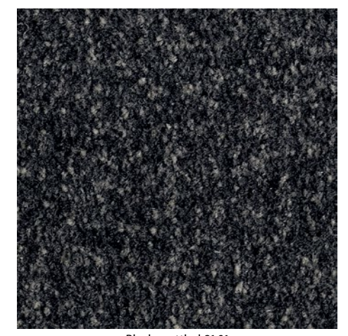
Black mottled 81.01

\label{thm:continuous} \textbf{Subject to technical modifications}