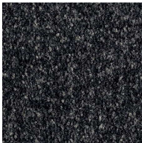
Black mottled 81.01