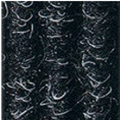
Anthracite no. 200

Warranty conditions are available at: www.emco-bau.com/en/warranty-conditions/