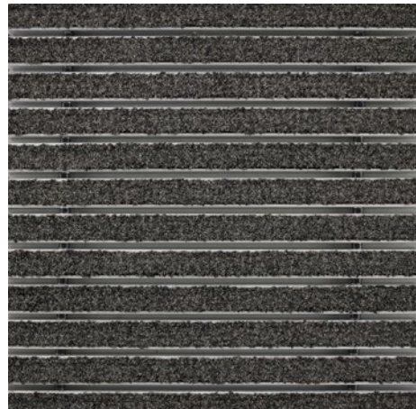
Black mottled 81.01