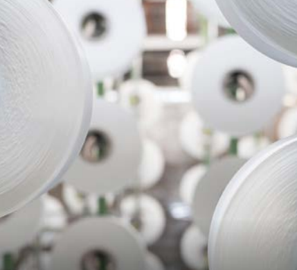
The result: a unique new development from the fibre sector for the global preservation of resources.