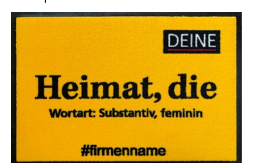
Heimat, die ps21731i