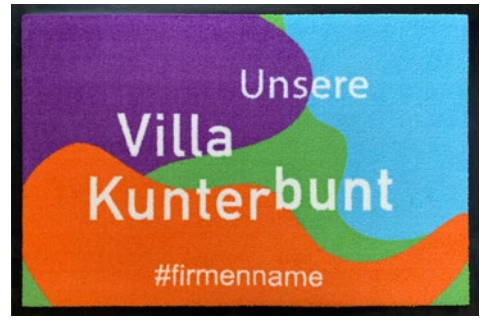
Villa Kunterbunt ps21731h