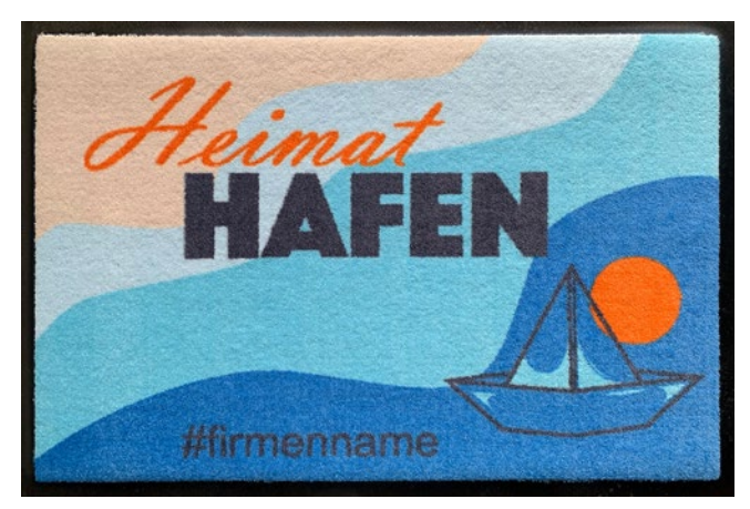
Heimat Hafen ps21731r