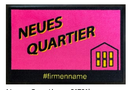
Neues Quartier ps21731k